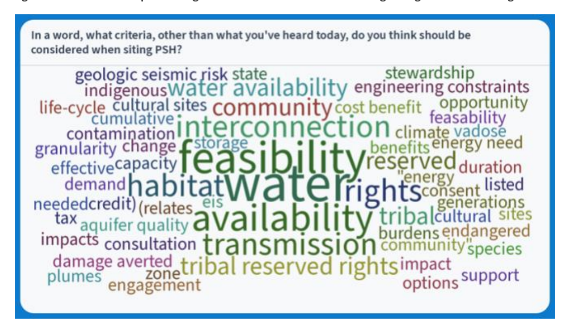
Figure 1. Word cloud representing the most common terms used regarding criteria for siting of PSH.

PollEverywhere was used to elicit information from participants throughout the meeting. Based on the study overview and introduction to PSH technology, participants were first asked: "In a word, what criteria, other than what you've heard today, do you think should be considered when siting PSH?" (Figure 1.